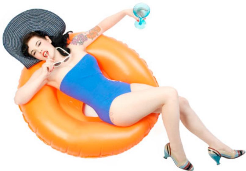
MODEL - ANNA COQUETTE