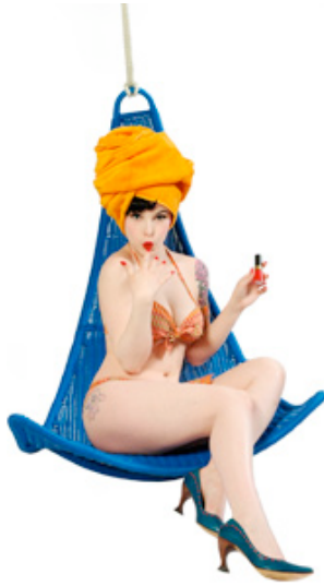
Plaid bandeau halter ($38) and bow bikini ($38, both Gap), orange bath towel ($4.99, Ikea) and Coffee Robusta blue pumps ($249, Fluevog).