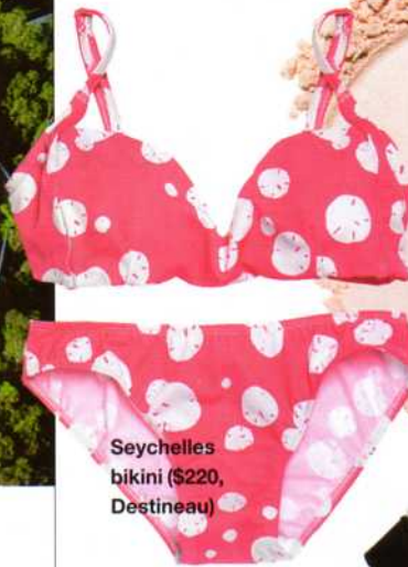
Seychelles bikini ($220, Destineau)

● Favourite hotel "I have many favourites around the world, but one that stands out in my mind is the San Domenico in Taormina, Sicily." ● Favourite cocktail "I love a great caipiroska." ● Favourite indulgence "Mango sorbet." ● Top five vacation must-haves "My iPod, La Roche-Posay Sun Block SPF 45, Quiksilver shorts, Havaianas and M.A.C Fix+." ● Favourite luggage "I have a Tumi obsession!" ● Favourite leisure activity "I love to swim in seawater." ● Favourite vacation reads "Vogue and Vanity Fair. I prefer to read magazines, although I did read Running with Scissors [by Augusten Burroughs] on vacation and loved it!" ● Favourite bathing beauties "Johnny Weissmuller as Tarzan, and Michael Phelps." ● Best souvenir "Feeling and looking rested when I get back to work."