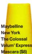
Maybelline New York The Colossal Volum' Express Mascara ($8)