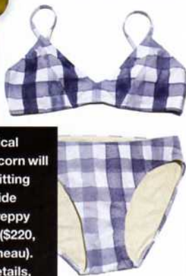
Practical Capricorn will love sitting poolside in a preppy bikini ($220, Destineau). For details, see Shopping Guide.

In many ways, you're in the most fortunate position of all 12 signs. But, hey, you deserve it. All through the '90s, you struggled with who you were, what your values were and where you should work. By the turn of the millennium, you were working so hard that, at times, you felt overwhelmed. Partnerships were challenging around 2003/2004, but that didn't hold you back. In fact, the lack of support simply stiffened your spine. In 2007, your confidence returned—along with your poise and diplomacy. Now, your assured strength will translate into an increase in assets through purchases and investments. Everything you've been working for is about to come to fruition. In late fall, a planetary shift will promote your good