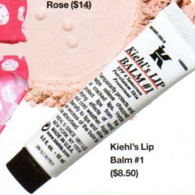
Kiehl's Lip Balm #1 ($8.50)