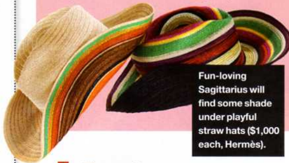
Fun-loving Sagittarius will find some shade under playful straw hats ($1,000 each, Hermès).

Do you remember how hard you worked to make a home for yourself in the early '90s? Sheesh! (You love travelling the world, but even you need a nice place to come home to.) After busting your buns at work in the late '90s, you made a breakthrough around 2001: "I'm on it!" The good news was that your ambition was aroused; the bad news was that partnerships took a dive. (Ouch.) Then, from 2003 to 2006, you were forced to get by on less because support from others diminished. (More ouch.) Fortunately, in the last few years you have bounced back big time—you've been on top of your game (and still are). You're confident: You know what you want and what you don't want. Many of you have brilliant money-making ideas to help boost your income. This good influence will continue for the rest of this year. The reason you're cooking on all burners is because Jupiter is boosting your optimism and your ability to maintain a positive frame of mind. This is critical for you! Optimism and physical activity are key survival issues for Sagittarius. (You're a hustler—and I mean this in the most positive way!) Mantra "I'm making hay while the sun shines!" Summer