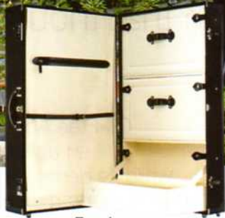
Townhouse wardrobe trunk ($8,212, Tumi)