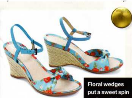
Floral wedges put a sweet spin on Scorpio's passionate nature ($110, Rockport).